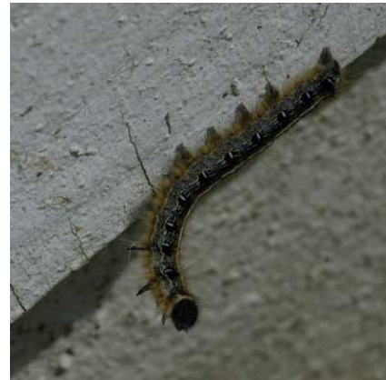
Caterpillar on north side of sanctuary (Future moth)