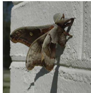
Moth on north side of sanctuary