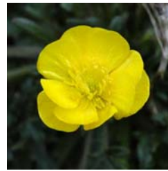
Approximately one inch wide. Unidentified