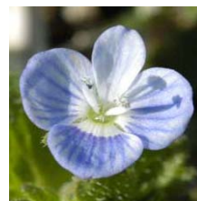
Speedwell, about one half inch wide found in traffic circle