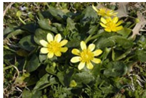
This flower is nearly 2 inches wide. If you can identify it, please send the answer to newsletter@wuu.org .