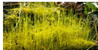
Moss in Memorial Garden, about 2 inches tall