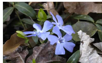
Vinca—one inch across Check Memorial Garden